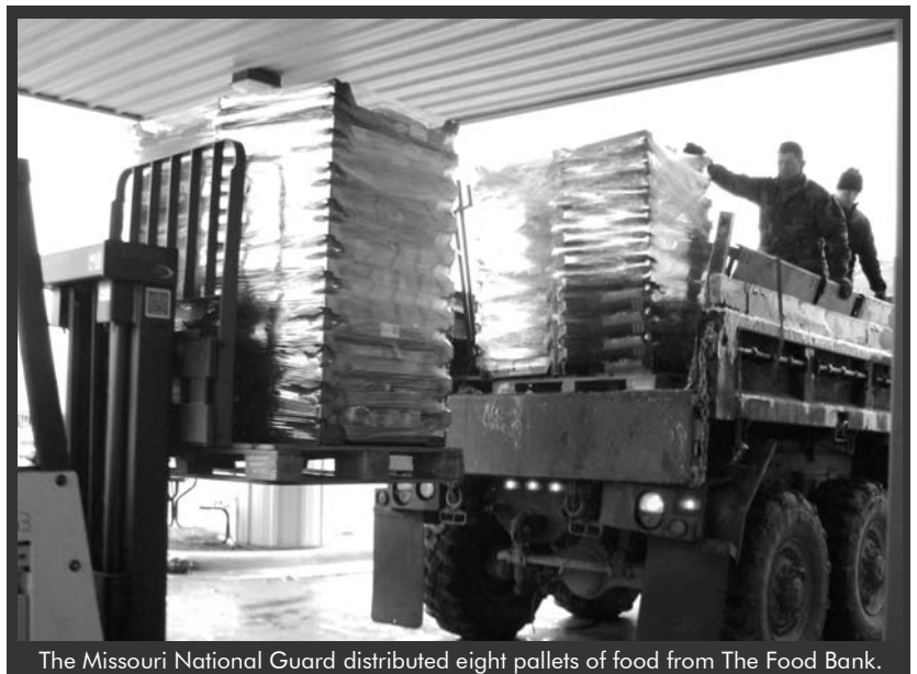
The Missouri National Guard distributed eight pallets of food from The Food Bank.