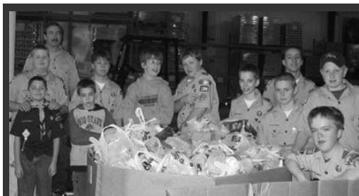
"Scouting for Food" collects more than 10,000 pounds of food each year.

If you don't see Boy Scouts in your neighborhood, you can still participate. Just bring your donation to Ozarks Food Harvest anytime during the week of March 5, or on March 11th from 9:00 am to 2:00 pm.