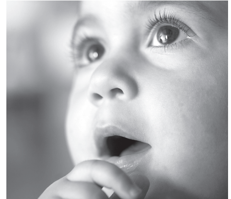
Look for this child's face at your local grocer to participate in Check Out Hunger now through December 31. Give online after December 31 at ozarksfoodharvest.org

So, while you're out shopping for the last few items to make that delicious