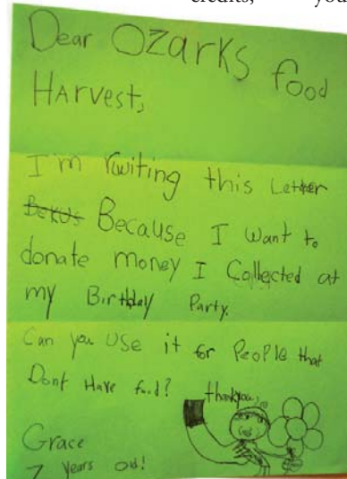
Seven-year-old Grace sent $74 to The Food Bank with the enclosed note above. Happy Birthday Grace!

To see if your donation will qualify for credits or to simply learn more, please visit ozarksfoodharvest.org/nap.html or consult your tax advisor.